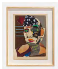
Untitled, 1972 Collage and oil crayon on paper 16 x 12 in (40.6 x 30.5 cm) Framed: 20.75 x 16.75 in. (52.7 x 42.6 cm)