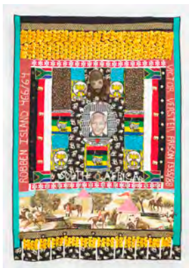
Homage to Nelson Mandela , 2014 Appliqué quilt, machine sewn/quilted with embellishments 80 x 53 in (203.2 x 134.6 cm)