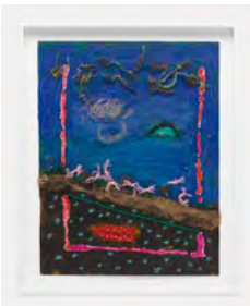
Easter Island Guardians 1, 1980 Acrylic, oil crayon, fabric, yarn and marker on paper 23 x 17.5 in (58.4 x 44.5 cm) Framed: 26.5 x 21.5 in. (67.3 x 54.6 cm)