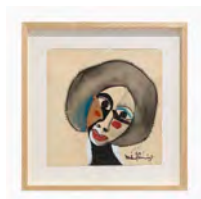
Untitled, 1969 Watercolor and collage on paper 11.5 x 11 in (29.2 x 27.9 cm) Framed: 16 x 15.75 in. (40.6 x 40 cm)