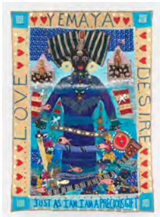
Yemaya , 2018 Appliqué quilt, machine sewn/quilted with embellishments 94 x 66 in (238.8 x 167.6 cm)