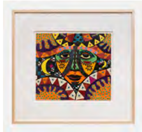
Sun Goddess III, 1975 Marker, mylar and collage on poster board 13.25 x 14.5 in (33.7 x 36.8 cm) Framed: 22.5 x 24.5 in. (57.2 x 62.2 cm)