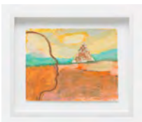
Looking for Paradise Lost in America, 1977 Oil crayon and collage on paper 9 x 11.75 in (22.9 x 29.8 cm) Framed: 12.75 x 15.5 in. (32.4 x 39.4 cm)