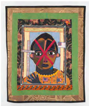
James Baldwin: Born into a Lie #2 , 2019 Appliqué quilt, machine sewn/quilted with embellishments 70 x 58 in (177.8 x 147.3 cm)