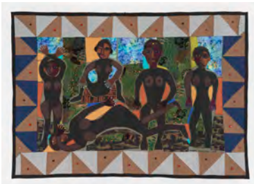
Waiting for Slave Ship Henrietta Marie , 2008 Appliqué quilt, machine sewn/quilted with embellishments 72 x 96 in (182.9 x 243.8 cm)