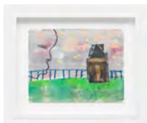
Looking for Paradise Lost in Museums, 1977 Oil crayon and collage on paper 9 x 11.75 in (22.9 x 29.8 cm) Framed: 12.75 x 15.5 in. (32.4 x 39.4 cm)