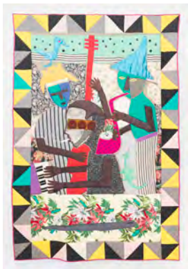
African Jazz #5 , 1990 Appliqué quilt, machine sewn/quilted with embellishments 108 x 72 in (274.3 x 182.9 cm)