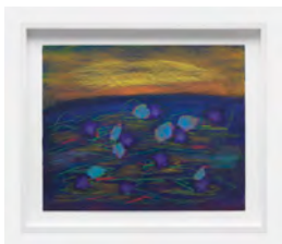
Water Lilies at Sunset 2 , 1978 Oil crayon, cut paper, and silk flowers on paper 15 x 18 in (38.1 x 45.7 cm) Framed: 19 x 21.5 in. (48.3 x 54.6 cm)