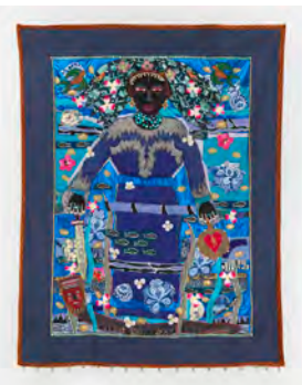
Brazilian Love Goddess , 2004 Appliqué quilt, machine sewn/quilted with embellishments 90 x 60 in (228.6 x 152.4 cm)