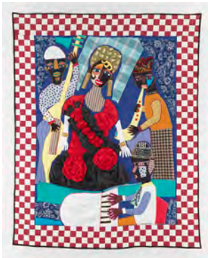
Josephine Baker in Cabaret, 2000 Appliqué quilt, machine sewn/quilted with embellishments 84 x 84 in (213.4 x 213.4 cm)