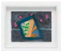
Easter Island 2, 1977 Acrylic and cut canvas on paper 9 x 12 in (22.9 x 30.5 cm) Framed: 12.75 x 15.5 in. (32.4 x 39.4 cm)