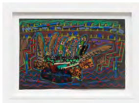
New Guinea 1, ca. 1980s Fabric, oil crayon, wood, and feathers on paper 15.125 x 22.125 in (38.4 x 56.2 cm) Framed: 19 x 26.5 in. (48.3 x 67.3 cm)