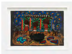
New Guinea 2, ca. 1980s Fabric, oil crayon, wood, and feathers on paper 15.125 x 22.625 in (38.4 x 57.5 cm) Framed: 19 x 26.5 in. (48.3 x 67.3 cm)