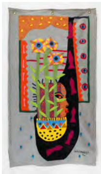
Mother Earth, 1975 Textile construction: felt, patent leather, rayon and ceramic beads 58 x 33 in (147.3 x 83.8 cm)