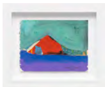
Easter Island 1, 1977 Acrylic and cut canvas on paper 9 x 12 in (22.9 x 30.5 cm) Framed: 12.75 x 15.5 in. (32.4 x 39.4 cm)