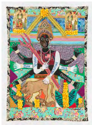
President Obama Goes to India, 2015 Appliqué quilt, machine sewn/quilted with embellishments 66 x 47 in (167.6 x 119.4 cm)