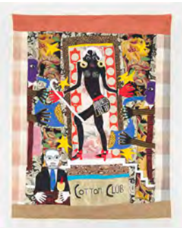
Henri Matisse in Harlem's Cotton Club , 2018 Appliqué quilt, machine sewn/quilted with embellishments 78 x 64 in (198.1 x 162.6 cm)