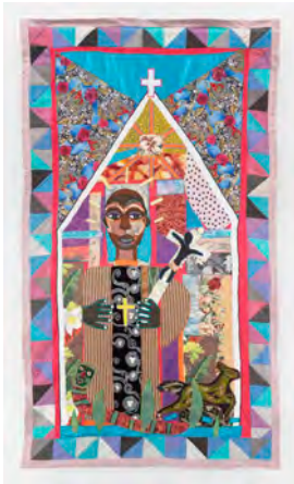
Take My Brother Home #2 , 1993 Appliqué quilt, machine sewn/quilted with embellishments 91 x 53 in (231.1 x 134.6 cm)