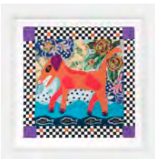
Great Big Dog , 1999 Fabric collage 24 x 24 1/2 in (61 x 62.2 cm) Framed: 29.5 x 29.5 in. (74.9 x 74.9 cm)