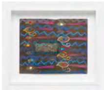
Eyes of Horus, 1978 Collage, acrylic and oil crayon on paper 9.5 x 11.75 in (24.1 x 29.8 cm) Framed: 13.25 x 15.5 in. (33.7 x 39.4 cm)