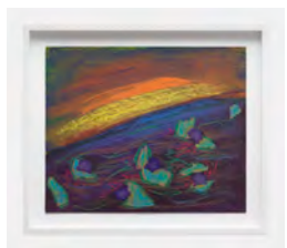
Water Lilies at Sunset 1 , 1978 Oil crayon, cut paper, and silk flowers on paper 15 x 18 in (38.1 x 45.7 cm) Framed: 19 x 21.5 in. (48.3 x 54.6 cm)