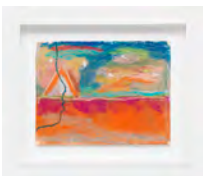
Looking for Paradise Lost at Night, 1977 Oil crayon on paper 9 x 11.75 in (22.9 x 29.8 cm) Framed: 12.75 x 15.5 in. (32.4 x 39.4 cm)