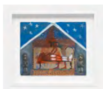
Anubis and Sarcophagus, 1978 Collage, acrylic and oil crayon on paper 9.5 x 11.75 in (24.1 x 29.8 cm) Framed: 13.25 x 15.5 in. (33.7 x 39.4 cm)