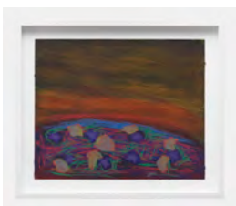
Water Lilies at Sunset 3 , 1978 Oil crayon, cut paper, and silk flowers on paper 15 x 18 in (38.1 x 45.7 cm) Framed: 19 x 21.5 in. (48.3 x 54.6 cm)