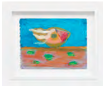
Easter Island 4, 1977 Acrylic and cut canvas on paper 9 x 12 in (22.9 x 30.5 cm) Framed: 12.75 x 15.5 in. (32.4 x 39.4 cm)