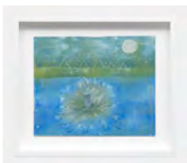
Egyptian Lotus, 1978 Collage, acrylic and oil crayon on paper 9.5 x 11.75 in (24.1 x 29.8 cm) Framed: 13.25 x 15.5 in. (33.7 x 39.4 cm)