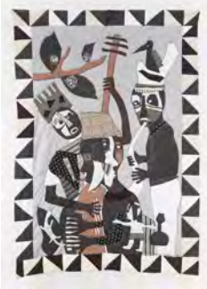
African Jazz #10 , 1990 Appliqué quilt, machine sewn/quilted with embellishments 108 x 72 in (274.3 x 182.9 cm)