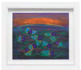
Water Lilies at Sunset 4 , 1978 Oil crayon, cut paper, and silk flowers on paper 15 x 18 in (38.1 x 45.7 cm) Framed: 19 x 21.5 in. (48.3 x 54.6 cm)