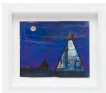
Pyramids Giza, 1978 Collage, acrylic, mylar and oil crayon on paper 9.5 x 11.75 in (24.1 x 29.8 cm) Framed: 13.25 x 15.5 in. (33.7 x 39.4 cm)