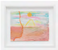
Looking for Paradise Lost in the Morning, 1977 Oil crayon on paper 9 x 11.75 in (22.9 x 29.8 cm) Framed: 12.75 x 15.5 in. (32.4 x 39.4 cm)