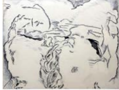
Laocoön [P-36] , 1987 Oil on canvas 52 x 68 in. (132.1 x 172.7 cm)