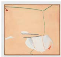
Black Clock [Painting Number 11] , 1969 Oil on canvas 18 x 24 in. (45.7 x 61 cm)