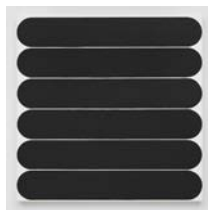
P-144 , 2008 Oil stick on canvas 50 1/4 x 50 in. (127.6 x 127 cm)