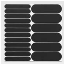
Tulip [P-143] , 2008 Gesso, titanium white acrylic, pencil, oil stick, and oil on canvas 48 x 48 x 2 in. (121.9 x 121.9 x 5.1 cm)