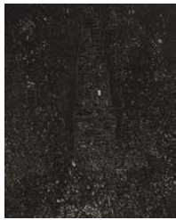
The Fable of Arachne (after Velázquez) [P-125] , 2003 Oil stick and Frankfurt black on canvas 78 x 60 in. (198.1 x 152.4 cm)