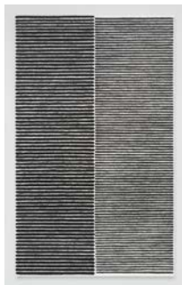
P-162 , 2013 Oil stick and graphite on canvas 74 x 45 in. (188 x 114.3 cm)