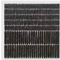
Rue de Sans Souci [P-128], 2006

Oil stick and graphite on canvas 68 x 68 in. (172.7 x 172.7 cm)