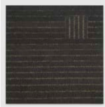
Prop [P(S)-5], 1979

Oil and graphite on canvas (four parts) Overall: 102 x 124 in. (259.1 x 315 cm)