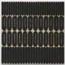
Camouflaged by Frailties [P(S)-27] , 1984 Oil stick and graphite on canvas 85 1/4 x 85 1/4 in. (216.54 x 216.54 cm)