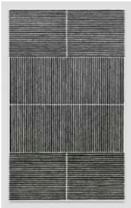
P-159 , 2012 Oil stick and graphite on canvas 73 3/4 x 45 in. (187.3 x 114.3 cm)